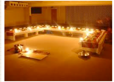
BANQUET OF ALL BELIEVERS